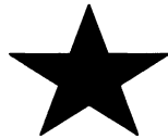
Figure 4 to Sec. 575.301 Sample Safety Concern Graphic for Sec. 575.301